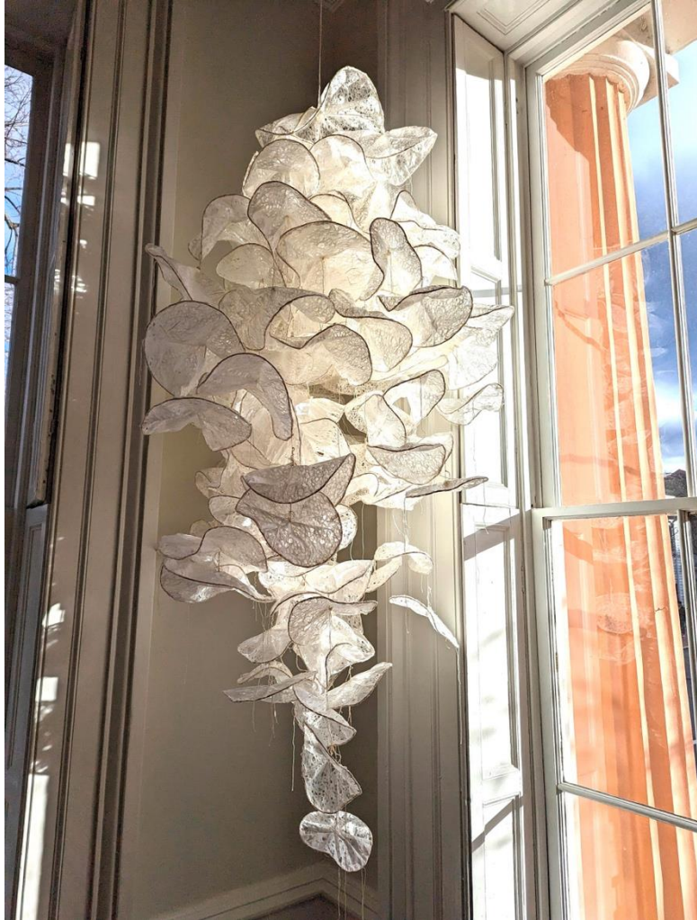
Sookkyung Park, Blooming