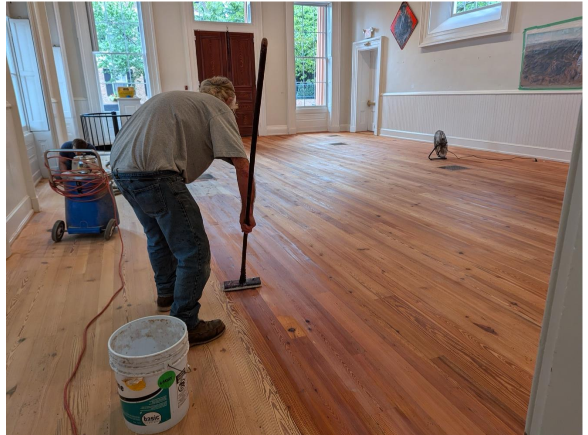
Applying new floor finish