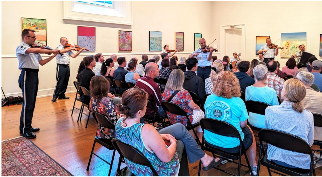
US Air Force Strings