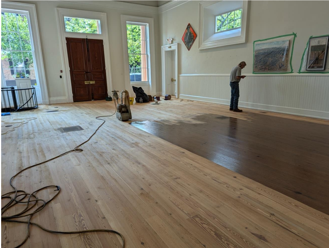
Removing old floor finish