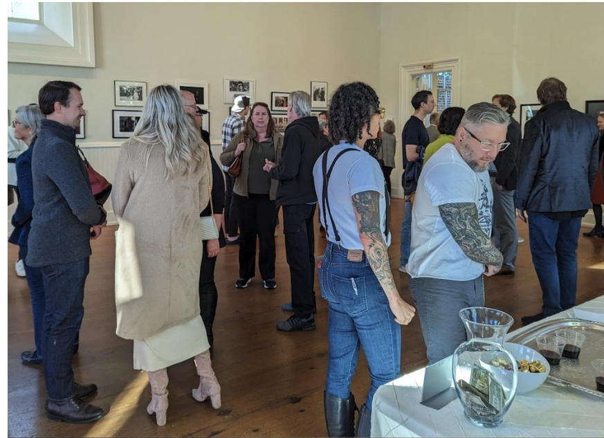
Fleeting Moments | Street Photography