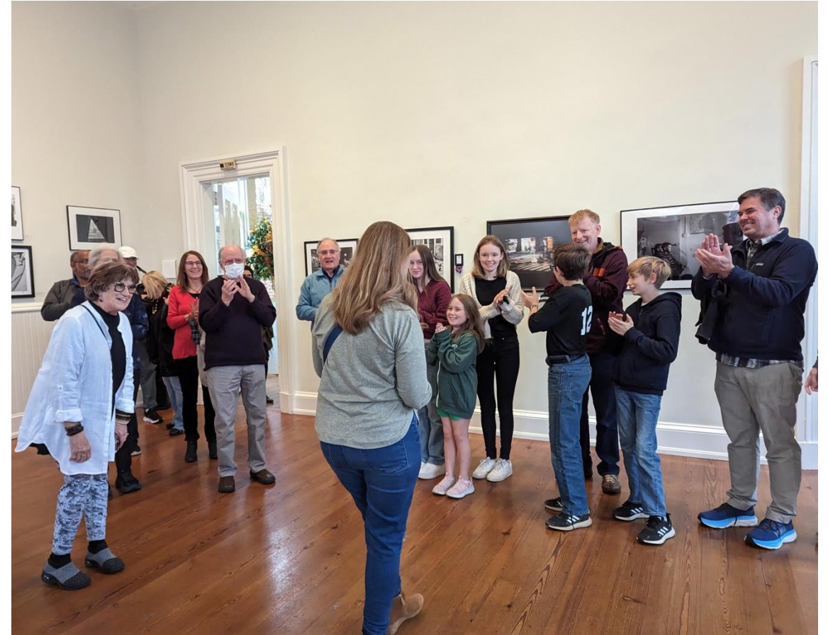
Fleeting Moments | Street Photography artis talk and People's Choice award announcement

Resumed partnering with the Hunting Creek Garden Club to host Marketplace at the Athenaeum