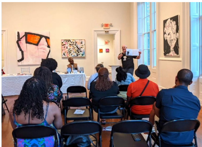
Authors and Appetizers