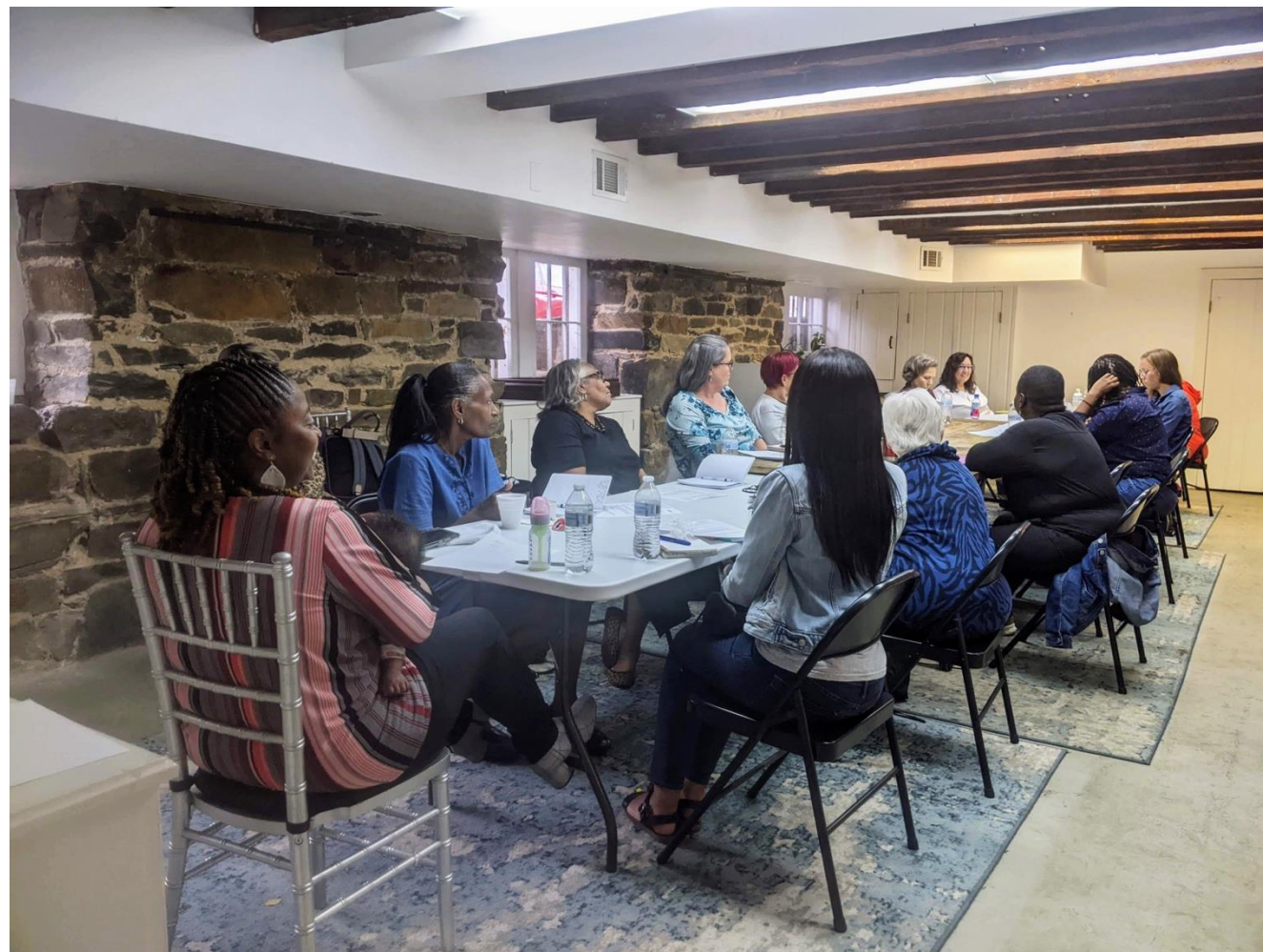
Write Like a Woman