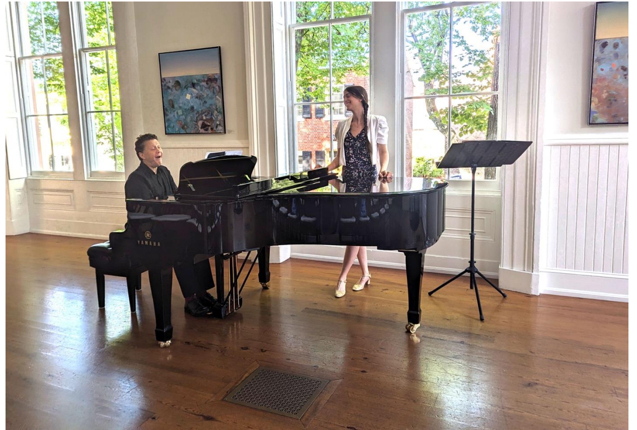
28 Chairs 5-year anniversary performance at the Athenaeum